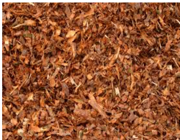
Figure-4: Softwood shaving/shreds.

may constitute risk to worker of poultry form affecting their health, causing infection to the respiratory system 8 . Like bacteria fungi is the other element present as bioaerosols which is also derived from dust and soil of poultry dust, and if present in large number, may cause immunological challenges to the respiratory system 9 . The long term existence and exposures to these in-borne fungal stored pores coming in the range of agricultural environment recognized to decline the lung function causing allergic diseases such as asthma and alveolitis or lung disease 10 . During the work activities in the poultry industries whether bird rearing or evacuating birds, whether spreading of straw or softwood shreds, or whether general maintenance and other service activities, the poultry industry workers are directly exposed to the dust which is present their in the poultry farm and inhale the bioaerosols resulting infection in lungs, trachea, the alveolar tubes and the whole respiratory system that lead to occupational asthma 11 . Finally the occupational asthma may be controlled by recognition of the specific hazards, applying good industrial practices such as wearing proper respiratory protection equipments like masks properly fitted to face. Also by reducing the exposures, use of proper respirators against poultry dust, and proper consequences should apply for the health of the workers by immediate hospital consultancies.