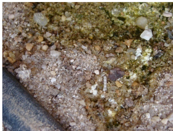
Figure-6: Bird's Feather / Dander.