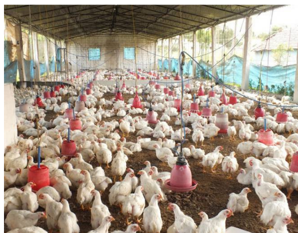
Figure-8: Poultry Farm House.