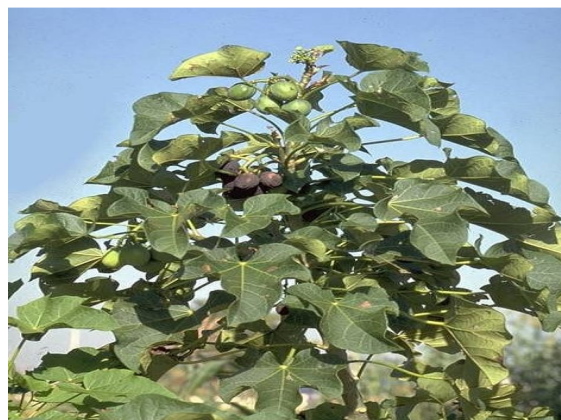
Jatropha curcas plant