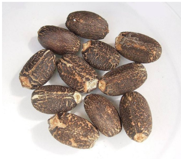
Jatropha curcas seed