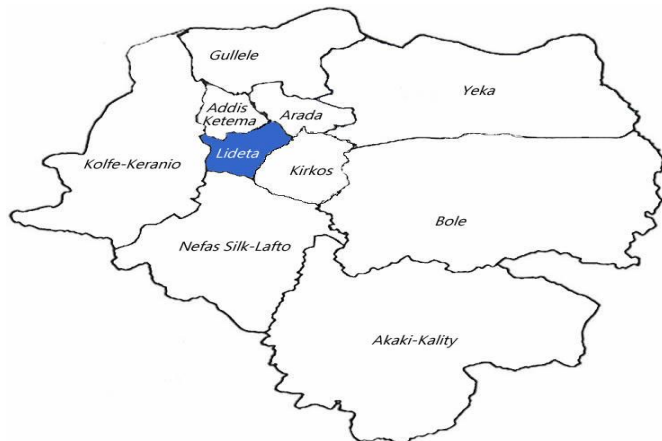
Figure-2: The map of Addis Ababa and Lideta sub-city 5 .

Sampling technique: Since 2011, there were 2052 MSEs in the sub-city with 16821 operators established in the areas of manufacturing, construction, urban agriculture, service, trade and cobblestone. For the purpose of this research, however, MSEs which were established in 2014/15 were included in the study. Within the selected time framework, 635 MSEs with 2218 operators had been established in the 10 woredas of the sub-city. There are 63 MSEs on average in each woreda. Three MSEs were selected from each woreda using purposive sampling to include all the business sectors. Five MSEs from each business area namely, manufacturing, construction, urban agriculture, service, trade and cobblestone were selected using purposive sampling and a total of 30 MSEs were selected. Finally, two members from each selected MSEs were contacted using purposive sampling method. Furthermore, interviews were conducted with selected officers based on purposive sampling method because they were found indispensable and resourceful in the area.