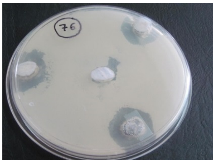
Figure-1 Inhibition of growth of S.cerevisiae by lovastatin produced by isolate 76

In the present study, total 15 isolates were screened for the production of lovastatin along with the standard strains Aspergillus terreus MTCC 479. All fungi tested (100%) showed clear zones around the wells on bioassay. The clear zone sizes varied with a range between 1.3 to 12.2 mm. The smallest halo of 1.3 mm was exhibited by isolate no.57 and highest of 12.2mm by isolate 76 (table 1, figure-1). Detection of clear zone by bioassay method is considered to be a qualitative assay for lovastatin. The different clear zones were produced due to the variations in physiology and genetic characteristics of the specimens. Other influencing factor could be the ability of the lovastatin to diffuse through the thickness of the agar, total microbial assay and the incubation period 15 .