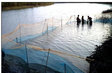
Fixed net or mashari jal