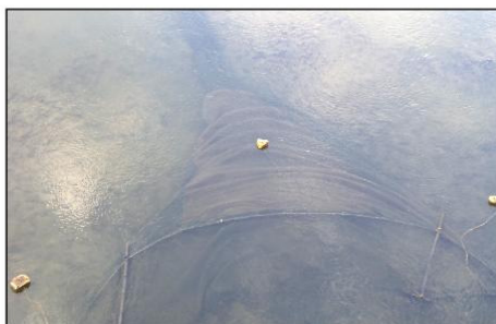
Been jal or behundi jal