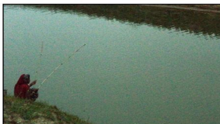
Line fishing or bardsi