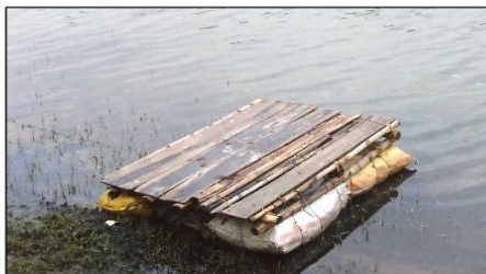
Raft or vala