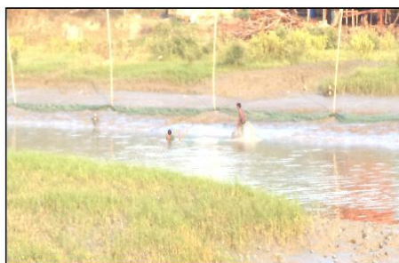
Suti jal or dhai jal