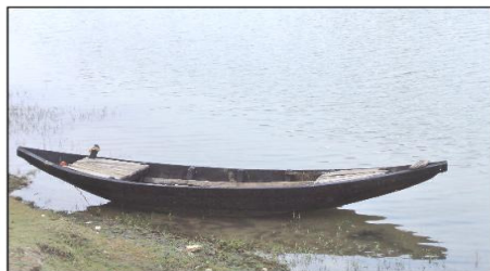
Dinghi or nauka