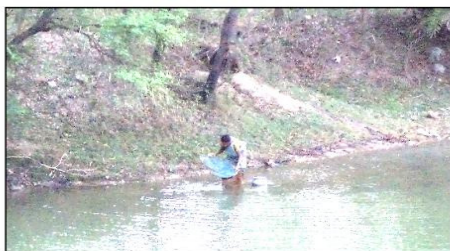
Scoop net without handle or chakni jal