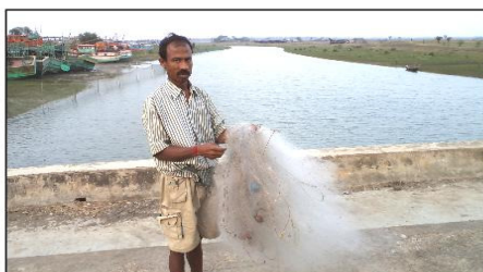
Gill net or bindha jal