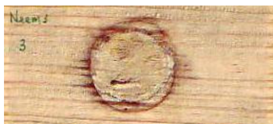
(a) Type of attack for the wood treated by AISO

Termiticidal activity of Azadirachta indica and Carapa procera seeds oils (AISO and CPSO)