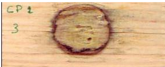
(b) Type of attack for the wood treated by CPSO