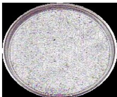
(a) Repellent activity of A. indica seed oil (AISO)

activity for both seeds oils (AISO and CPSO) obtained in the hot temperature (69 °C) and denote the highest repellent activity can be achieve with polar solvents or with oils obtained under cold temperature conditions.