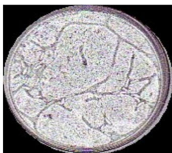
(d) Solvent control