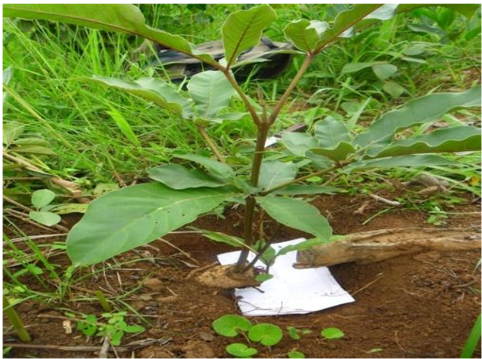
Figure-2: After complete sectioning of a Vitex doniana root, a sucker formed on the proximal end of the part of the root disconnected from the parent tree.