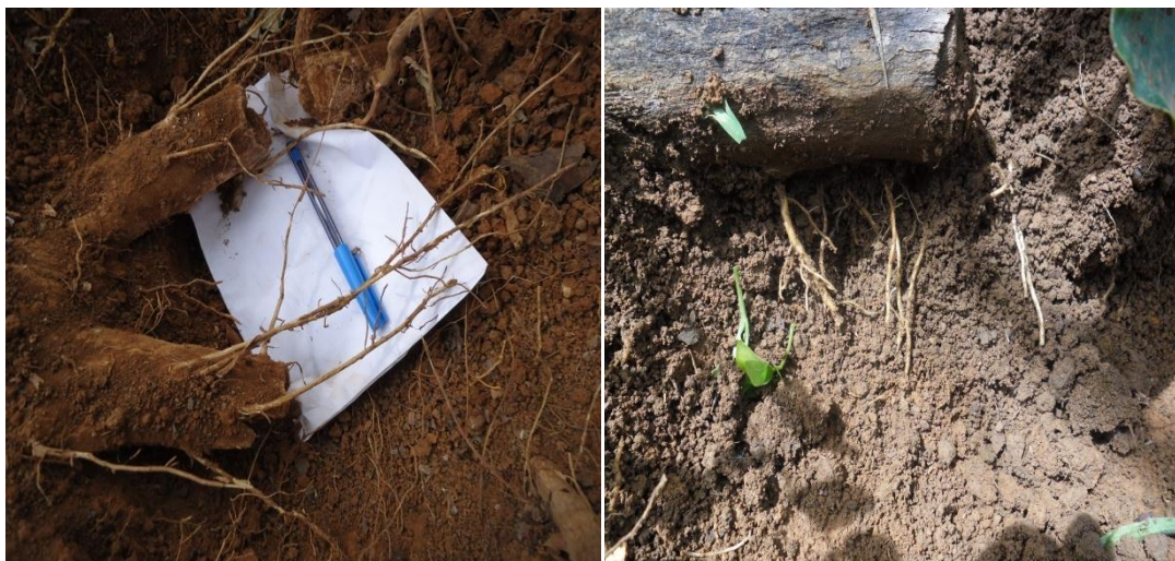
Figure-4: Rooting at the distal pole of the part (=proximal) still connected to the mother tree: root covered with soil (a) and root exposed (b). In these two photos, the mother tree is located on the left.

The Studies carried out on Balanites aegyptiaca , Diospyros mespyliiformis and Sclerocarya birrea show a high proportion of proximal suckers 14 . Physiological responses vary with species. Similarly in Uganda Melia azedarach has developed exclusively proximal suckers 6 . Albizia adianthifolia in the Democratic Republic of Congo emits suckers on both the proximal and distal end 16 . This result suggests that the position of development of suckers on the root varies according to species.