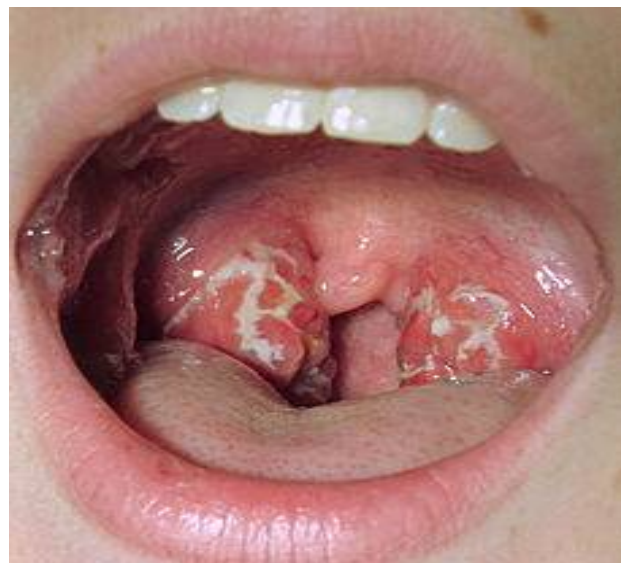
Figure-2 Inflamed Tonsils 3

Tonsillitis is the inflammation of the pharyngeal tonsils. Along with the pharyngeal tonsils, the adenoids and the lingual tonsils may also get inflamed involve other areas of back of throat including the adenoids and the lingual tonsils. Tonsillitis may be caused due to any viral or bacterial infections or any other immunological factor 1 . It is very common in India. Children are more commonly affected 2 . It spreads through air borne droplet infection through throat or nasal fluids etc. The incubation period varies from 2-4 days. In severe or recurring cases of tonsillitis removal of tonsils i.e Tonsillectomy is advised.