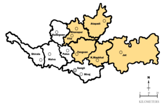
Figure-3 Map of Sangli District