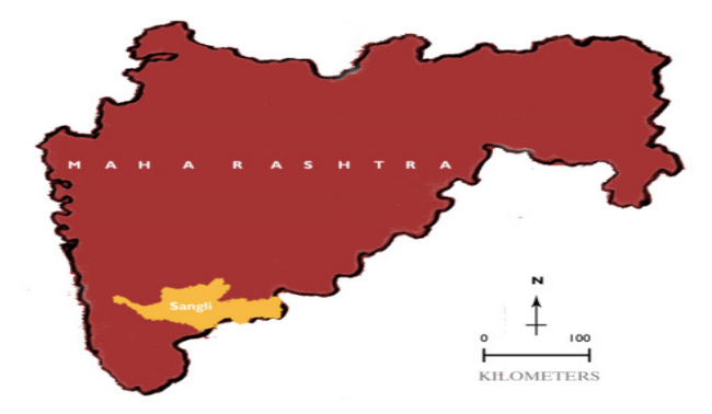
Figure-2 Map of Maharashtra showing location of Sangli district