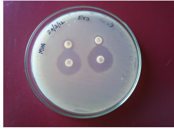
Figure-2 Plate showing ESBL production by Combination Disc Method(CDM)