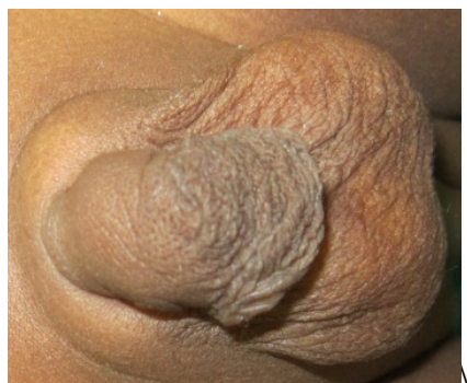
Figure-6 Dorsal hooded prepuce

Discussion: Schilbach and Rott described a syndrome comprising ocular hypotelorism, epicanthic folds, upslanting palpebral fissures, blepharophimosis, and submucosal cleft palate in a mother and her three children. Both sons had hypospadias to varying degrees. Minor anomalies included mild cutaneous syndactyly of the third and fourth fingers and second and third toes. The children had normal heights and normal intellectual development. The original family described by Schilbach and Rott consisted of 10 individuals in five generations with syndromal hypospadias 2 . The aetiology is uncertain at present. The mode of inheritance is autosomal dominant. The other reports of this syndrome include Mexican father and son with Schilbach-Rott syndrome reported by Becerra-Solano, 4-year-old Brazilian girl reported by De Carvalho et al, Jewish family of Turkish-Libyan descent in which a father and his 2 offspring, a boy and a girl had features most reminiscent of Schilbach-Rott syndrome reported by Shkalim et al 3-5 . Two cases reported by Joss et al with cleft palate, hypospadias and facial appearance closely resemble Schilbach Rott syndrome 6 .