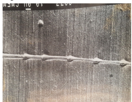
Figure-3: Electron microscopic micrographs of titanium scratch on molybdenum at 5g.