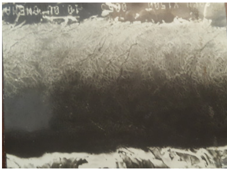
Figure-2: Electron microscopic micrographs of titanium scratch on copper at 5g.

These results are in agreement with BUTLER in case of a soft and ductile deposit<sup>9</sup>. According to Laugier, the coating in front of the tip undergoes a compression during which a certain energy is stored in front<sup>6</sup>. When this energy is sufficient to provide both the work necessary to elastically deform the film and the adhesion work, the tip moving gradually, the raised portion of the coating in front of the tip is pushed back, the film on the edge of the scratch being under stress state can deform plastically. At this point, the energy stored in front of the tip becomes minimal and the process begins again. This phenomenon shows a succession of periodic patterns on the edges of the trace. The energy required to elastically deform the film can be neglected in front of the adhesion energy. Scanning electron scratch of titanium thin films prepared with tantalum are illustrated in Figure-4.