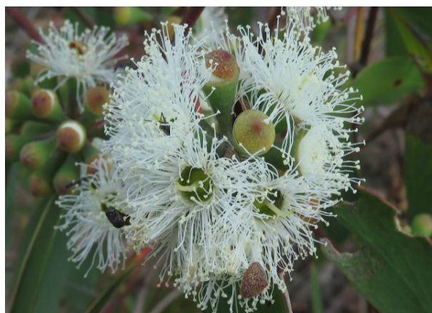
Figure-4a: Flower of Eucalyptus globules 59 .