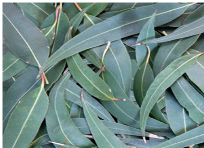
Figure-2: Leaves of Eucalyptus globules 12 .

Leaf: Eucalyptus globulus tree is an evergreen but some of the species at tropical regions in the end of the dry seasons lost their leaves (Figure-2). The leaves of the tree on the juvenile shoots are sessile, opposite, cordateovate and covered with the bluish white bloom and leaves on an adult stage are yellowish petioate 1.4-5 cm long, narrowly lanceolate, acute at base, thick, entire, glabrous, leathery, alternate, glossy or waxy dark green and also the leaves on seedlings are quadrangular and glaucous 12-14 .