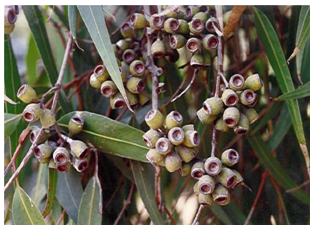
Figure-4b: Fruit of Eucalyptus globules 60 .