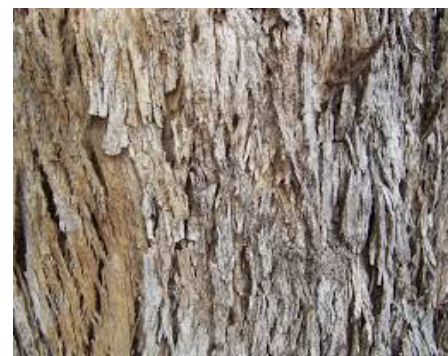
Figure-3c: White box Bark 3 .