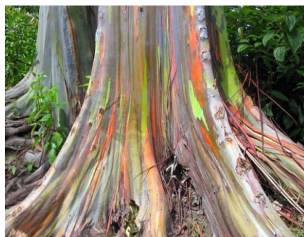
Figure-3a: Colored Bark 3 .

The leaf wax contains the constituents such as 16-hydroxy-18-tritricotanone, 4-hydroxytritricotan-16, 18-di-one and a novel antioxidant compound such as ntritricotan-16, 18-dione isolated. Moreover, the compounds which are biological active such as phloroglucinol based derivatives with an attached terpene moiety, flavonoids and tannins, 1,8-oleanolic and masinic acid has been isolated from the leaves 12, 21-24 .