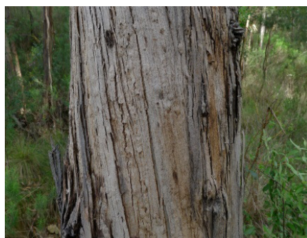
Figure-3b: Bark 3 .