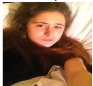
Figure-1: "Can't contain the excitement" <sup>12</sup>.

Understatement selfies: Diefenback & Christoforakos<sup>3</sup> explore two different strategies of self-presentation that a selfie allows: self-promotion and self-disclosure. With reference, however, to the taxonomy by Merzbacher<sup>11</sup>, Diefenbach & Christoforakos point to strategies of self-presentation that seem less compatible with selfies: understatement is one of them. Understatement is a strategic presentation of oneself "ostensibly downplaying one's relevance, abilities and achievements", while "implicitly expecting objections from others", finally leading to a positive re-valuation of the self. Miller<sup>12</sup> also argues that such selfies "are usually intended to elicit some kind of supportive response from one's concerned friends". Such selfies can be found under e.g. the unrevealing hashtag #ruinedselfie on Instagram. Examples of them are the following: