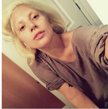
Figures-5a and 5b: Lady Gaga<sup>24,25</sup>