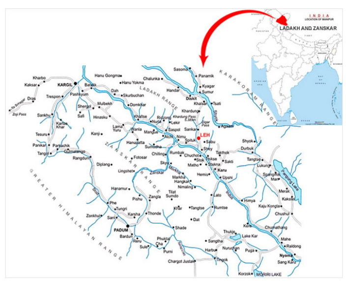
Figure-1: Map of Ladakh<sup>1</sup>.

experiences fast winds blowing at the rate of 40-60km/hr., usually in the afternoon. Being a cold desert and on the leeward side of the Himalayas, this region receives less than 50mm precipitation annually, mostly in the form of snow during winter. The monsoon does not reach Ladakh as it falls on the rain shadow side of the Himalayas, thus leaving Ladakh very dry. Therefore, it is categorized as a cold desert<sup>2</sup>.