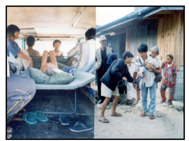
Figure-8 Adulthood/Old Age

"Much care is extended to sick adult Ifugaos by the members of the community"