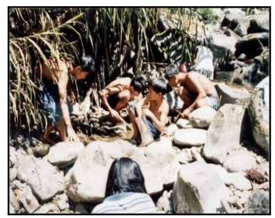
Figure-6 Infant Care and Child-rearing

Ifugao children are taught the fundamental values of obedience and respect for the elders; malice and the use of vulgar language are strictly prohibited. Children are trained to do some household chores. Training given to the girls is distinctly different from the training given to the boys.