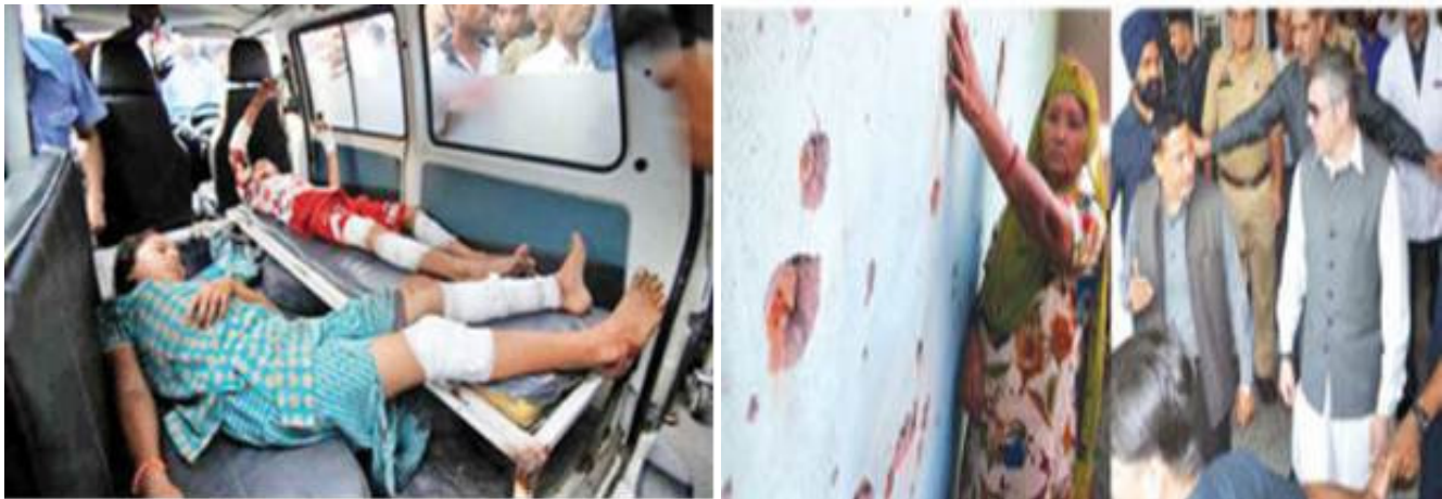
Figure-2 Children injured in Pak firing and C.M. interacting with border people (State Times, October 18th, 2013)

Dr. Singh’s own view, as expressed by him on 1 October, aptly characterises the present state of Indo-Pak talks as diplomacy of sentiments rather than substance. He was responding to questions during an onboard media interaction while on his way back home from New York. He was specifically asked whether Mr. Sharif “is being held back by the ISI and the Pakistan Army”. Dr Singh skirted the questioner’s references to the ISI and the Pakistan Army and, instead, summed up the essence of the current state of Indo-Pak relations as follows: “I very much hope that Nawaz Sharif succeeds. He is the democratically elected Prime Minister of a neighbouring country, and he has said all the right things about Indo-Pakistan relations. So, I sincerely hope and pray that he does succeed in carrying out his mission” 13 .