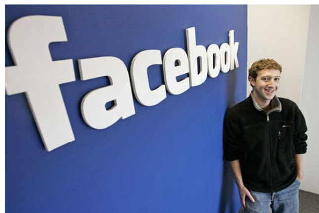
Figure-3 Facebook Inc.

Facebook: Facebook is a social network service and website launched in February 2004 that is operated and privately owned by Facebook, Inc. i.e. figure-3.