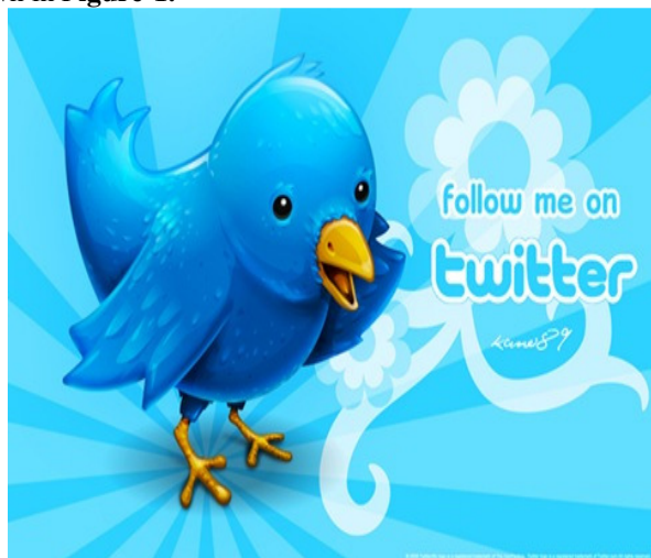
Figure-1 Twitter Logo

Twitter: Twitter is a mini-blogging platform that one can use to send messages of 140 characters or less to family, friends, or just the general Web community at large, popularly appears as shown in Figure-1 .