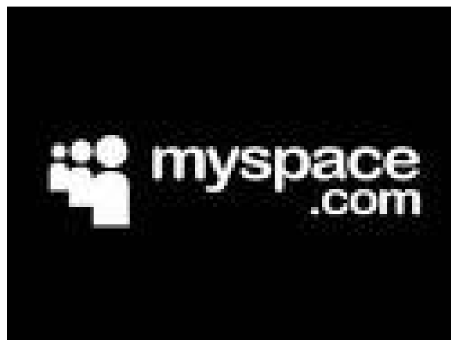
Figure-4 Logo of myspace.com

MY Space: Myspace stylized My_____ and previously MySpace, is a social networking website. Popular logo is shown in the figure-4 Its headquarters are in Beverly Hills, California where it shares an office building with its immediate owner, news corp. digital media, owned by news corporation. It embraces both publishing and socializing tools. 8