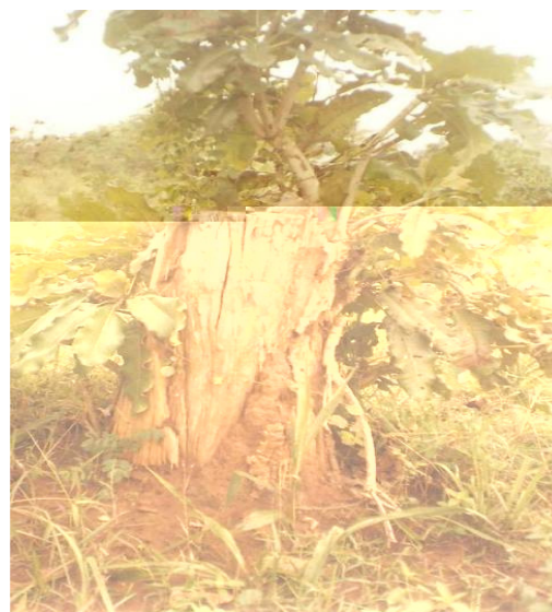
Figure-2 Shea coppices sprouting on a stump attacked by termites

respondent do not influence people's willingness to plant shea trees. It means that the local people would not be influenced by these factors in order to be able to plant shea and other indigenous trees. Therefore, any tree planting program in the region should consider factors such as marital status and land ownership before its implementation in the area.