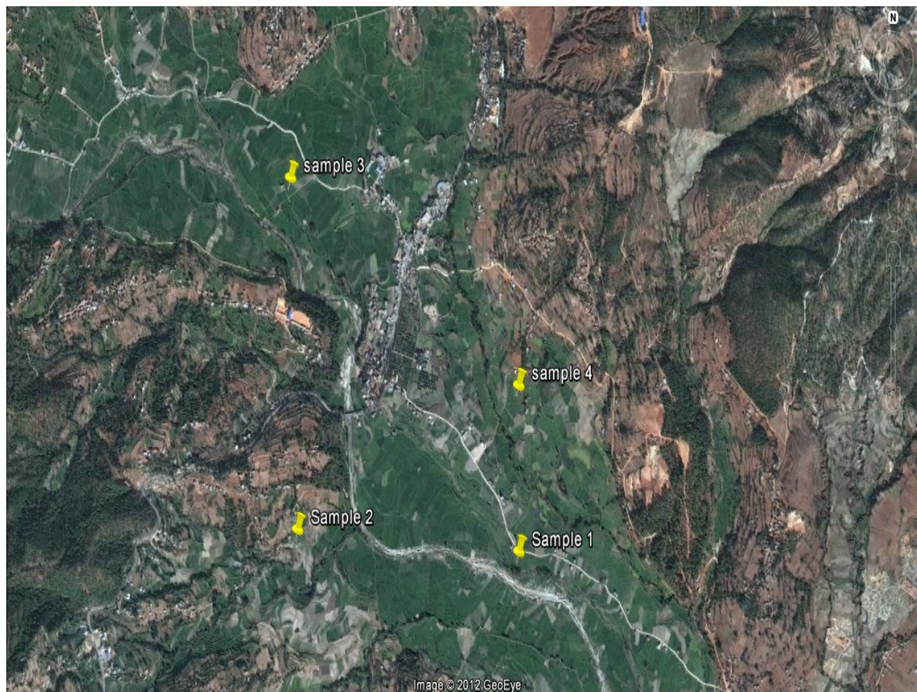
Figure-1 Sampling Sites in Paanchkhaal Valley via Google Earth