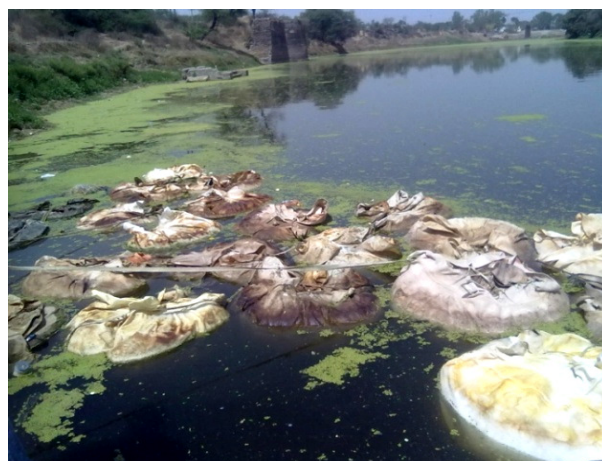
Figure-3 Wastewater used for Irrigation