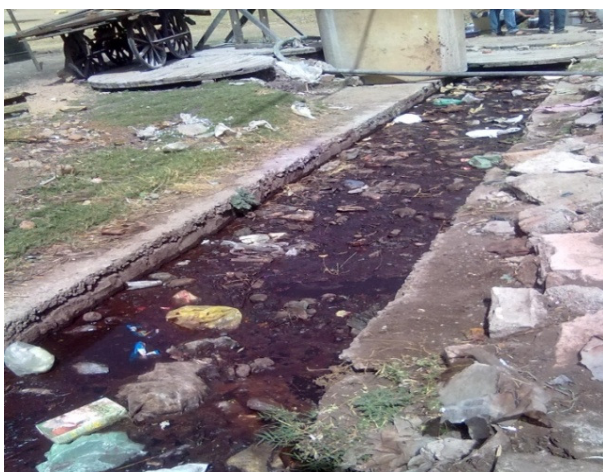
Figure-1 Effluent of Dye Industries