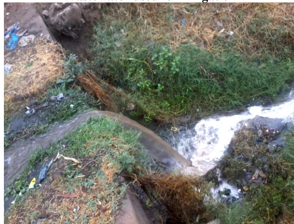
Figure-4 Washing of Dye Clothes