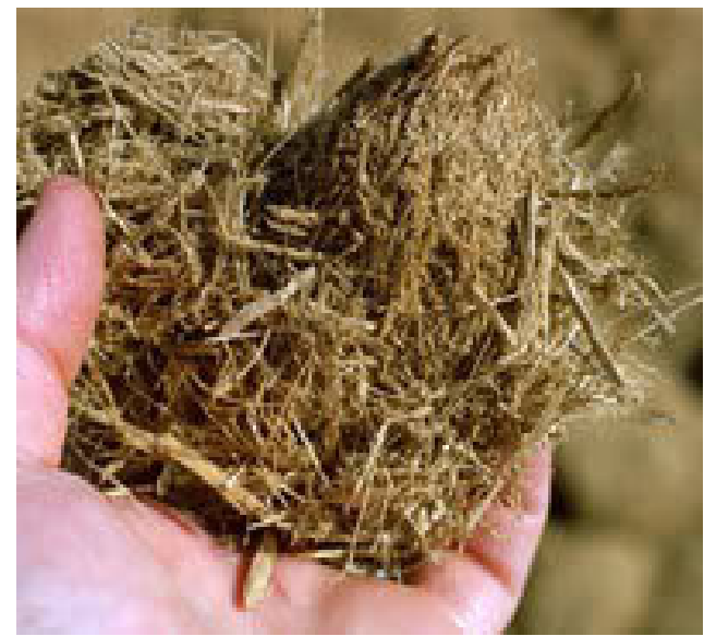
Figure- 1 Agricultural Residue

I Research Journal of Environment Sciences_ Vol. 1(1), 54-57, August (2012)