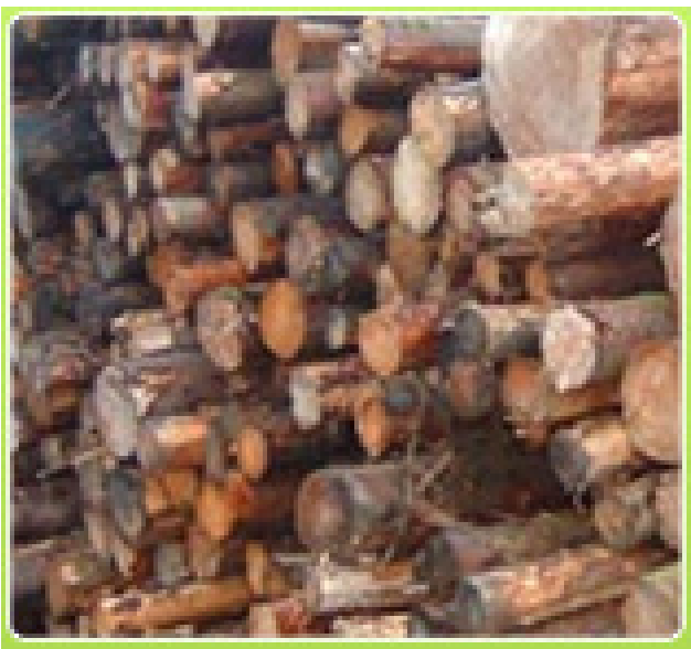
Figure- 2 Forestry Residue