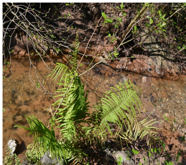
Figure-2: Photo of Pteris vittata L. Beach Saint Louis 19-02-2016

Moreover, the flora of 24 indicates a station on Numidia (Figure-3), and this confirms a revision of the flora of 9 .