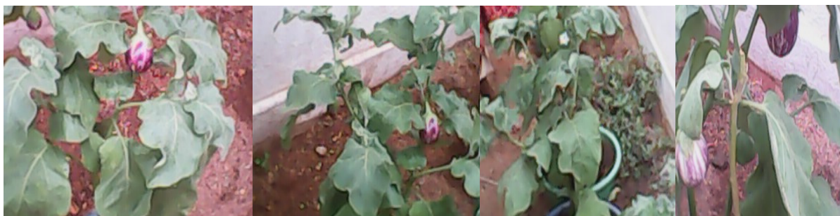
Figure-2 Impact of vermicomposts on growth and yield attributes of Solanum melongena - Pot culture