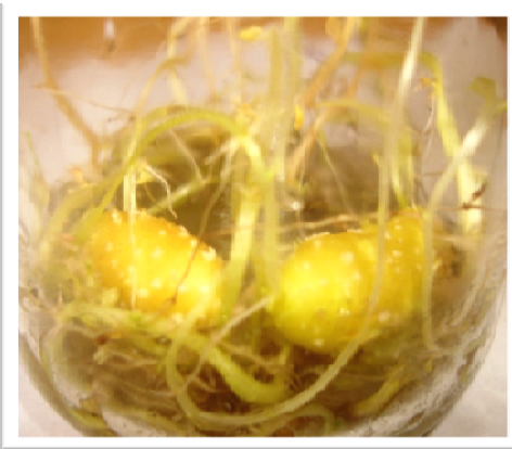
Figure-1 In vitro micro tuber formation from potato plant cultivar Almera on MS medium without growth regulators, supplemented with sucrose 80 g/l at left and 60 g/l at right

The effect of sucrose on microtuberizations: The highest numbers of tubers (6.0\pm0.5^{\rm a}) and 3.0\pm0.0^{\rm a} ) were obtained from cultivar Amera and Diamant respectively on MS medium containing 80 g/l of sucrose. It was observed that 30 g/l sucrose produced shoots without micro tubers; indicating that high sucrose concentration increased osmotic pressure, creating a stress which shifted the plantlets to maturity and tuber genesis. This may be the stimulus for producing utmost tuber digit with both cultivars at 80 g/l sucrose. This result concise with the finding of Hussain et al. ^{14} .