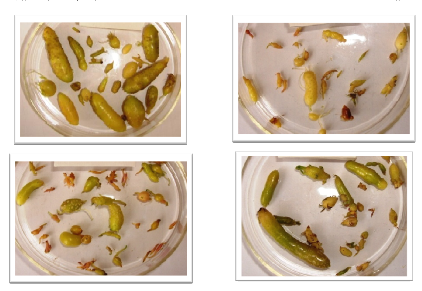
Figure-2 Micro tuber obtained after harvesting , the left (upper and bottom) under dark condition, the right (upper and bottom) under light condition from cvs Almera and Diamant respectively