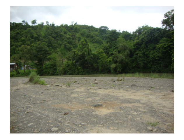
Figure - 3 Riverine habitat of Tiger Beetles