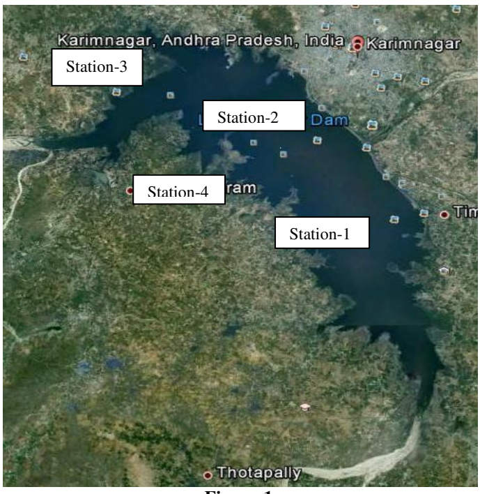
Figure-1 Map of the study area showing the different sampling stations