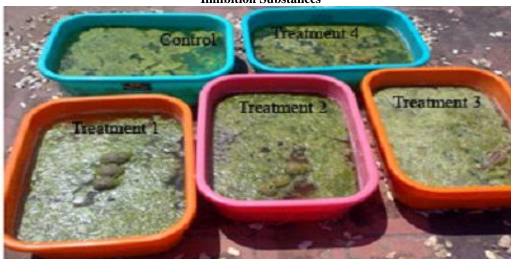
Figure-3 Experimental Setup after adding inhibition substances