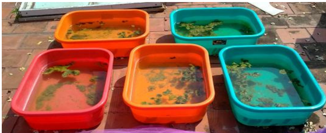
Figure-1 Experimental Set up