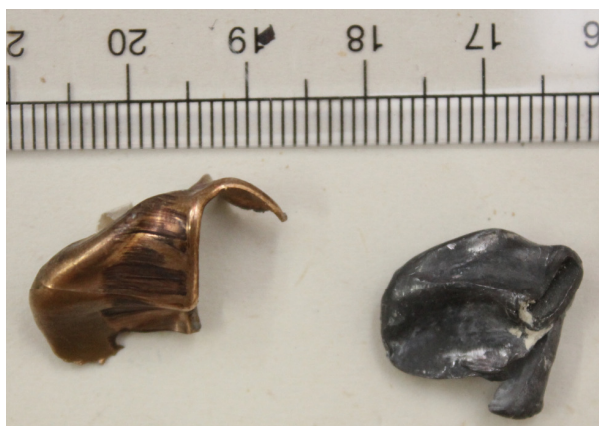
Figure-1: Copper jacket and lead core.

Figure-1 and 2 also shows that fitting of copper jacket on the lead core has left fitting marks on the lead core found in skull, proving that the lead core, before entering the skull was fitted with a copper jacket hence it proved it was a fired 9 mm copper jacketed bullet initially.