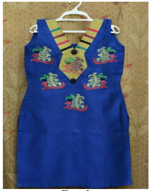
Figure-2 Blue kurti showing Chinese motifs using Kutch embroidery