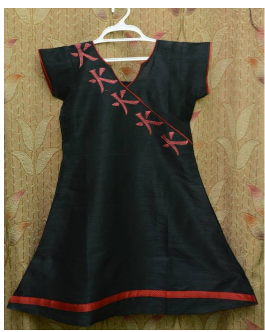
Figure-1 Presentation of Chinese motifs using Kutch embroidery on black kurti