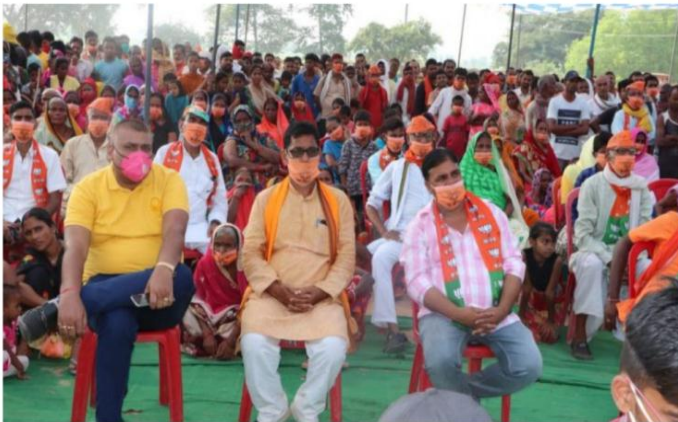
The crowd at a rally addressed by Bihar Deputy Chief Minister Sushil Kumar Modi at Ramgarh in Kaimur district

conducted with proper guidelines and safety measures to avoid the massive spread of COVID-19 pandemic.