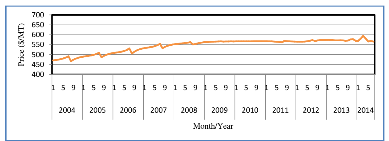
Figure-3 Trend of rice price in India