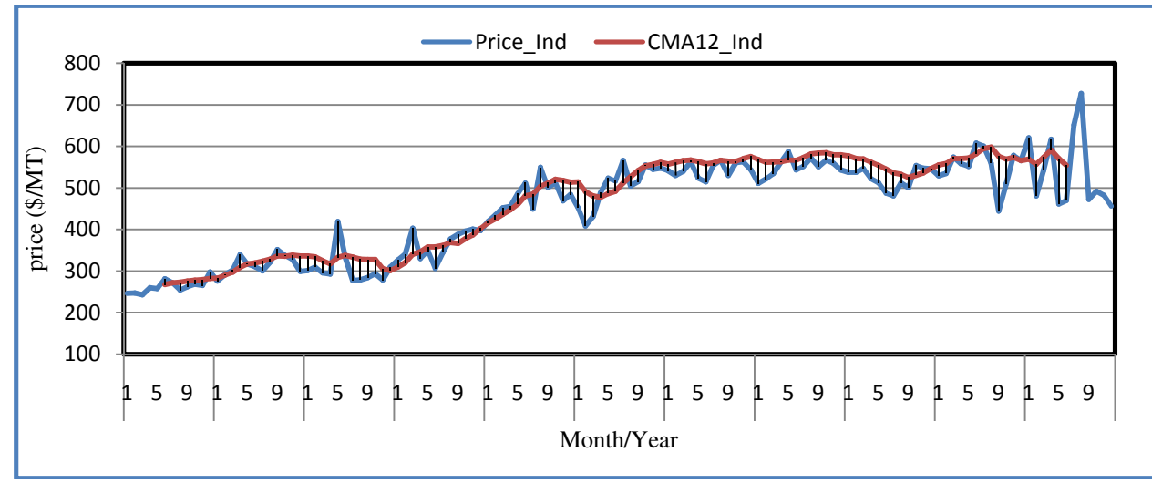
Figure-2 Price and Moving Average of rice for India