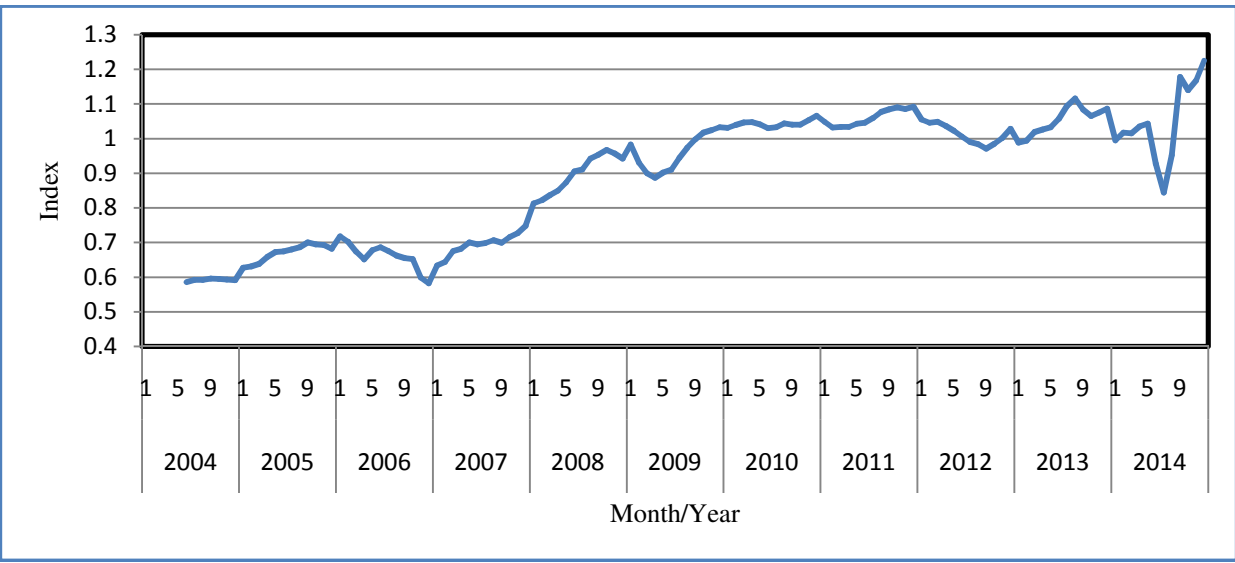
Figure-5 Cyclical Indices of rice price in India