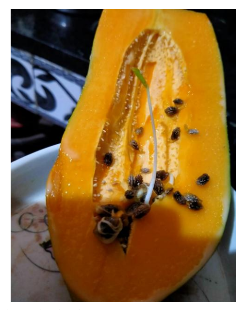
Figure-1: Showing viviparous seed germination in Carica papaya.